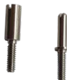
Image depict coding pins required