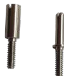
Image depict coding pins required