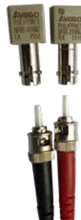
Image above Fibre Optic Patch ST-ST Multi-Mode