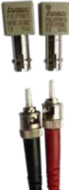
Image above Fibre Optic Patch ST-ST Multi-Mode