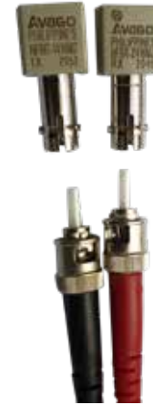
Image above Fibre Optic Patch ST-ST Multi-Mode