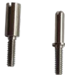
Image depict coding pins required