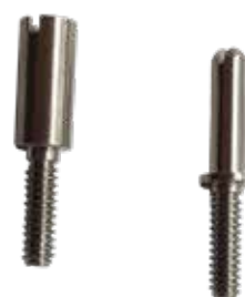
Image depict coding pins required