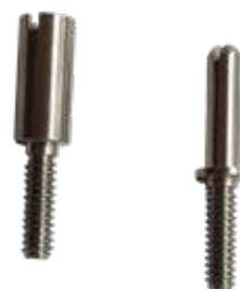
Image depict coding pins required