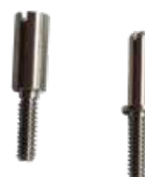
Image depict coding pins required