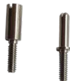
Image depict coding pins required