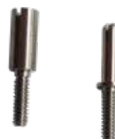
Image depict coding pins required