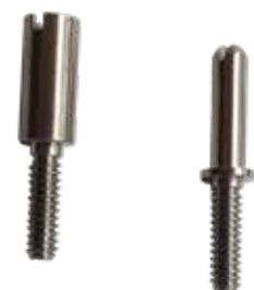
Image depict coding pins required