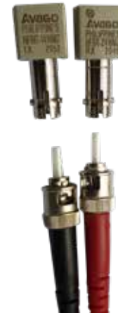
Image above Fibre Optic Patch ST-ST Multi-Mode