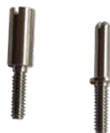
Image depict coding pins required