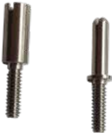
Image depict coding pins required