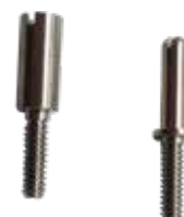
Image depict coding pins required